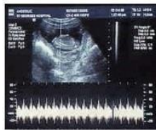
Detecting heartbeat with doppler